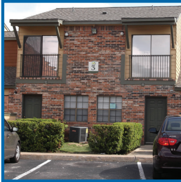
Sunscape Softlite 25 on all windows