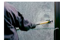
Break-ins and smash & grab