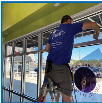
During the installation process