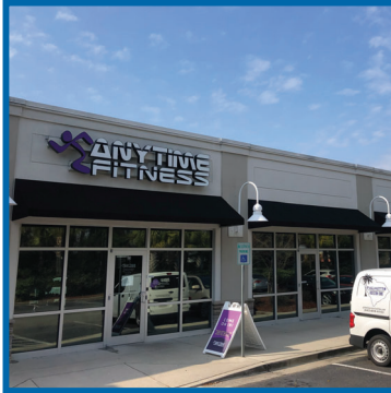
Uniform exterior appearance after installation is complete