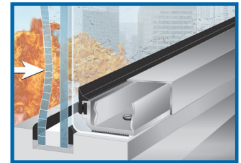
Blast impact shatters external glass and drives it against the inner pane.